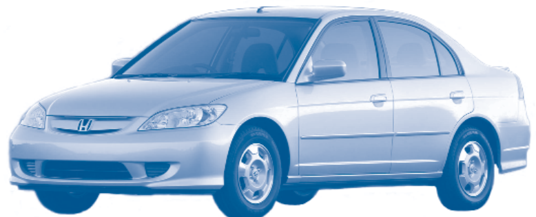
The Second Generation Prius (above left) and Honda Civic Hybrid (above), two popular hybrid choices.

A growing number of local and state governments are purchasing hybrids for their fleets. Hybrids are used in agencies' general motor pools, and also can be assigned to specific drivers. iii New York City, for instance, has purchased over 650 Toyota Prius vehicles for use in a range of municipal agencies, such as the Departments of Parks and Recreation, Health, Buildings, and Transportation. In Martin County, Florida, the Sheriff's Office uses 11 Priuses and 8 hybrid Civics for detective work, parking enforcement, and other non-emergency tasks. Due to the hybrids' great gas mileage in city traffic, the county estimates that it saves an average of $103 a